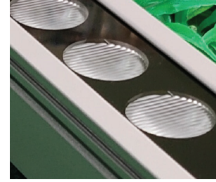
Tempered Glass Diffuser