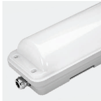
SS 304 PG13.5