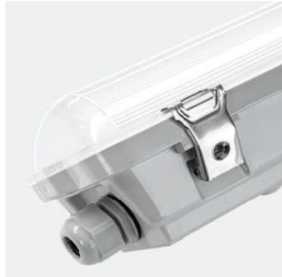
SS 304 Clips